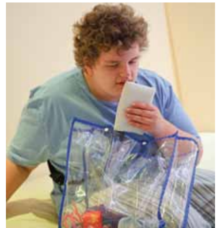
Time for massage

encouraged to feel and smell the object of reference which was then attached to a bag around his waist. We filmed his interaction with the OR and the staff member, his decision on which way to turn and his subsequent journey. This was repeated daily over several weeks, allowing for absences due illness and holidays.