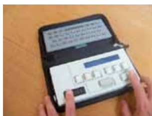
2) Db person reads the text in Braille