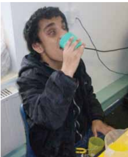
drinking a milkshake

information gained through smell can be overridden by information from other senses