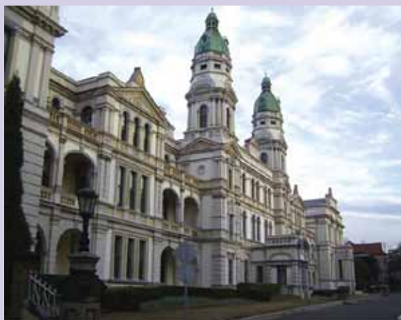
Royal Institute's original building in Newtown

Thomas Pattison, a deaf migrant from Scotland, commenced classes with seven other deaf children in a converted house in