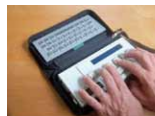
3) Db person types text in Braille