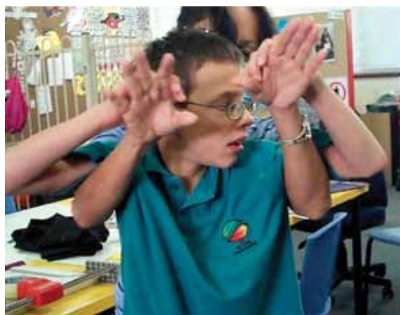
Left: Ocean surge