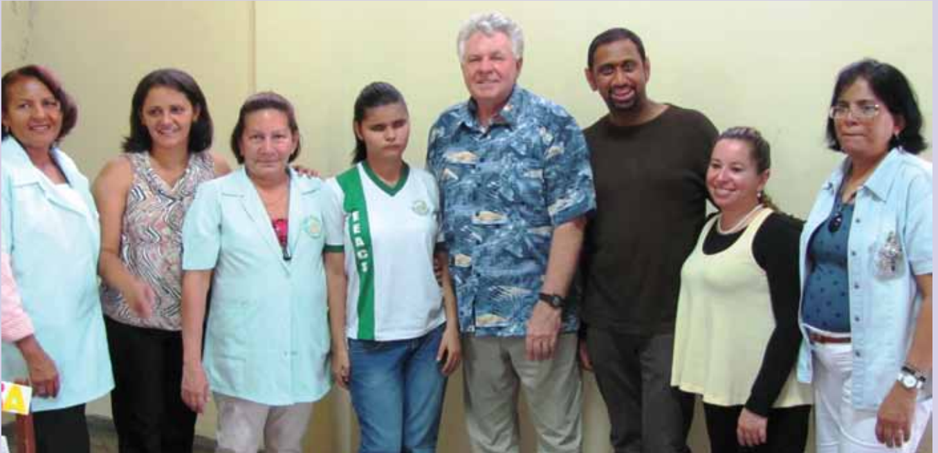
Deafblind young lady with her family and school teachers in Manaus meet with seminar presenters