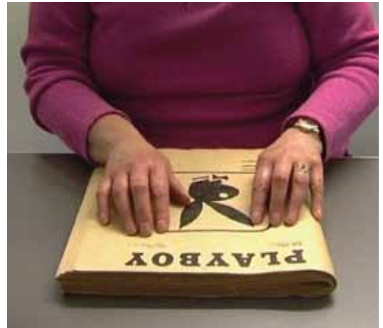
Braille edition of Playboy magazine