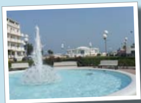
The sea front