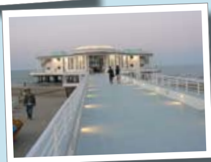
Rotonda a mare