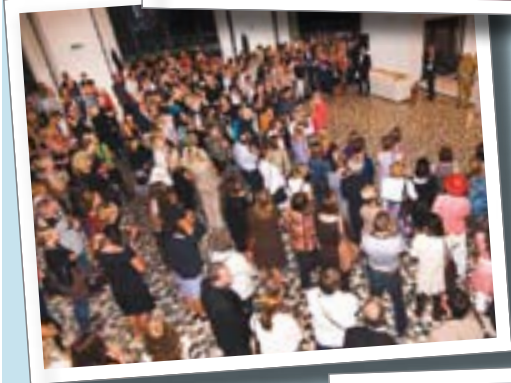
Welcome to Senigallia