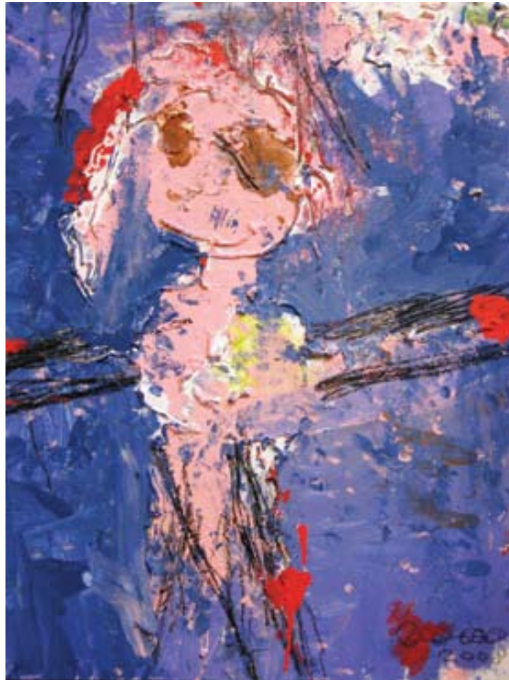
A religious painting

The start of 2007 became significant for young deafblind people and their parents in Slovakia. On 2 January 2007, parents brought their deafblind adult children to Maják and gave them an opportunity to live their own full-valued life, in which each individual is recognized as a unique personality. It was a huge