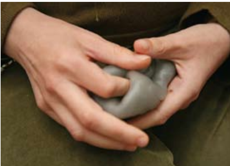
Working the material