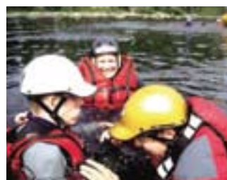
On the water