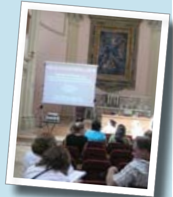
Workshop in Chiesa dei Concelli