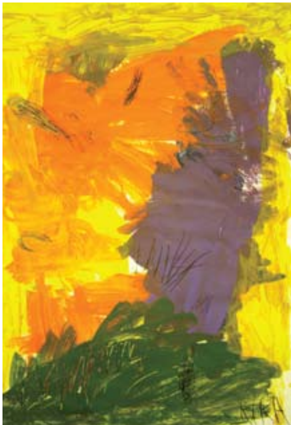
A harmony of colours

deafblind people. But they didn't have any practical experience in the work with deafblind people and they had difficulties in coping with problematic situations with residents. Some of them wanted to leave after a month – feeling they could not succeed. We worked hard to overcome this.