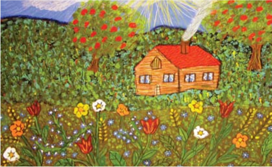
Juraj puts a little house or a young woman into almost every painting