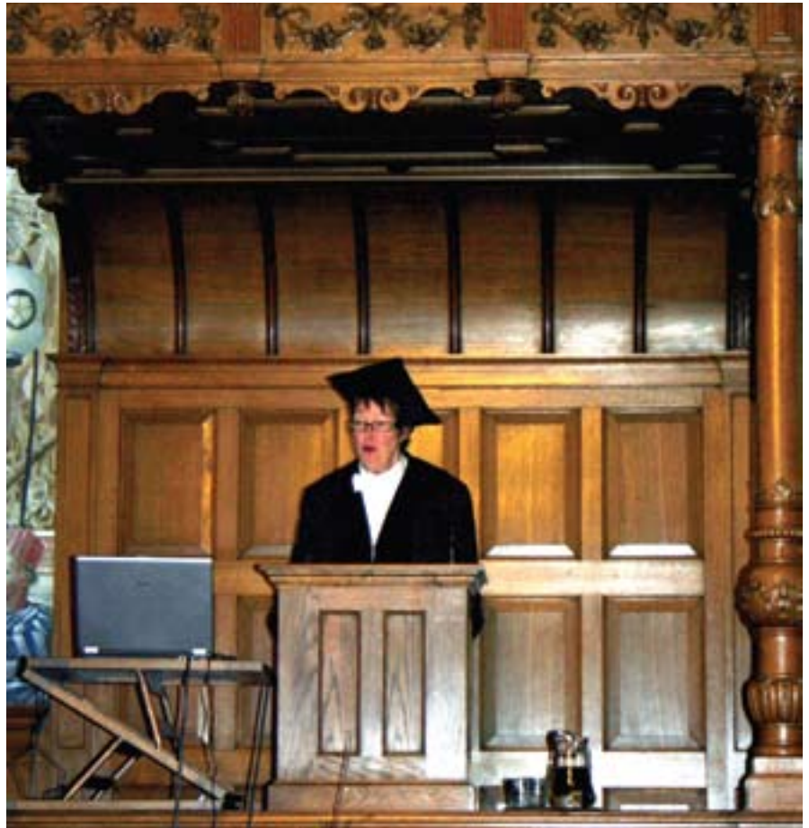
Addressing the assembly