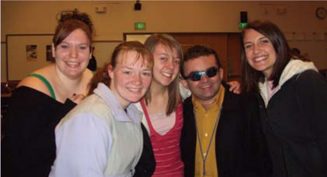
Making new friends

respect of people to include disabled people in things which belong to all society. They have achieved this level by thinking in an intelligent way. Accessibility has brought equality between people and, as a consequence of it, respect. Accessible Eugene exports its characteristics. In Eugene, people with disabilities are not afraid of showing themselves in public. They aren't afraid to talk about the difficulties they face.