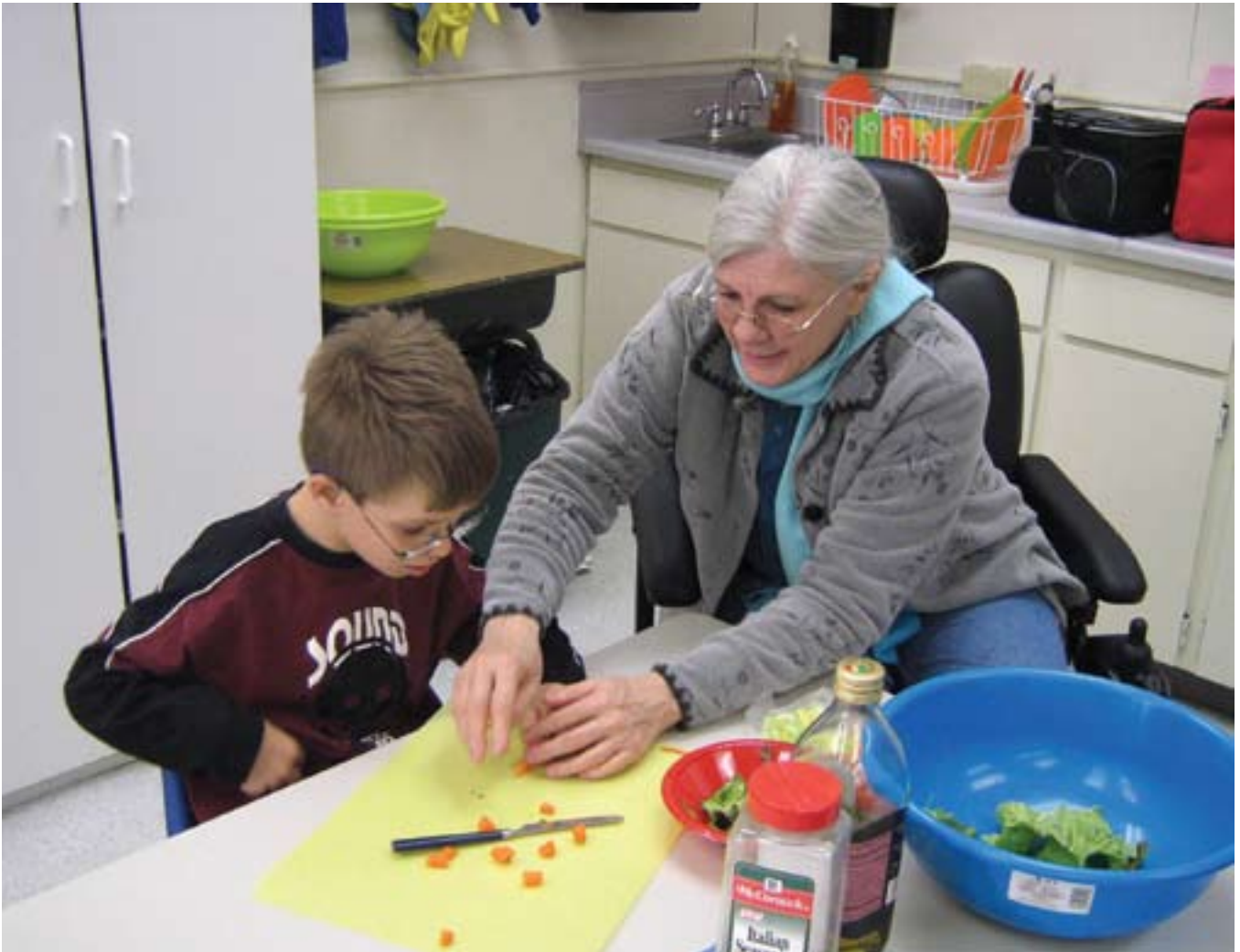
Making a salad

many of these examples there was a clear need for sensory integration assessment and programming along with the other strategies mentioned: