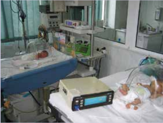
Babies in the Dr Ioan Cantacuzino hospital