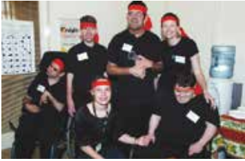
Left: Dance therapy group