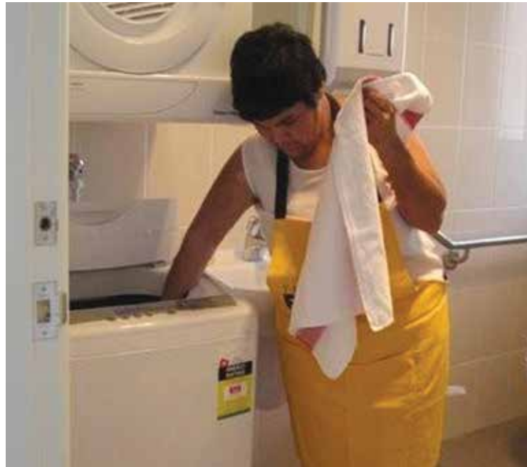
Everyday activities at home

Lesson 9 These are essential as part of the agency's comprehensive service provision.