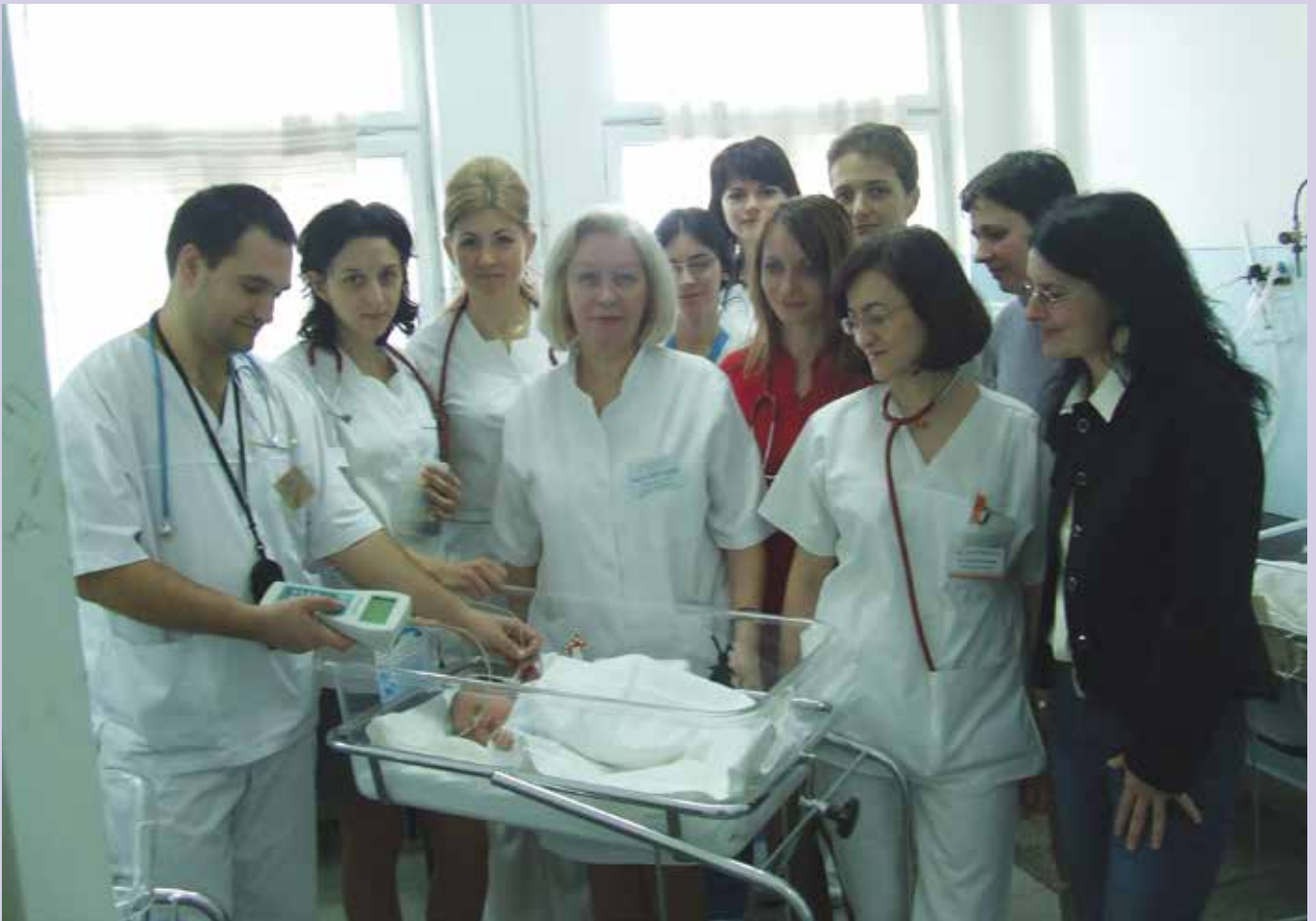
The multi-disciplinary team at Oradea Maternity Hospital