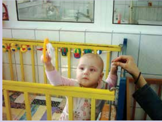
Baby in Prof. Dr. Panait Sarbu Maternity Hospital