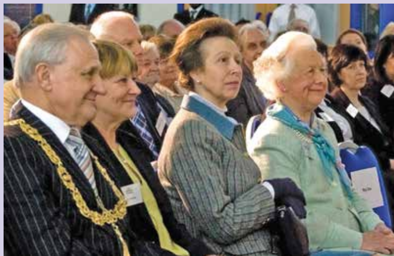
HRH the Princess Royal

As I came into work on the 15th April I was inevitably reflecting on the journey our organisation has made from our humble beginnings in a cloakroom to preparing today for the Royal opening of TouchBase. Our centre is usually an energetic place to work but this morning it was more lively than usual. Staff were bringing in flowers, cleaners were arriving, final lists were being prepared, name badges were being laid out, catering was gathering apace, signs were being put out, technology was being checked, finishing touches to the stage, lighting, seating etc were all being done by different groups of staff.