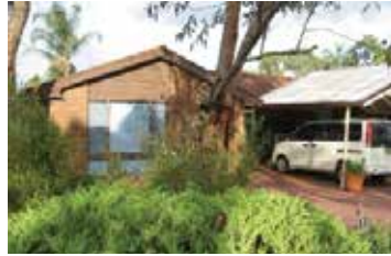
Right: Household duties