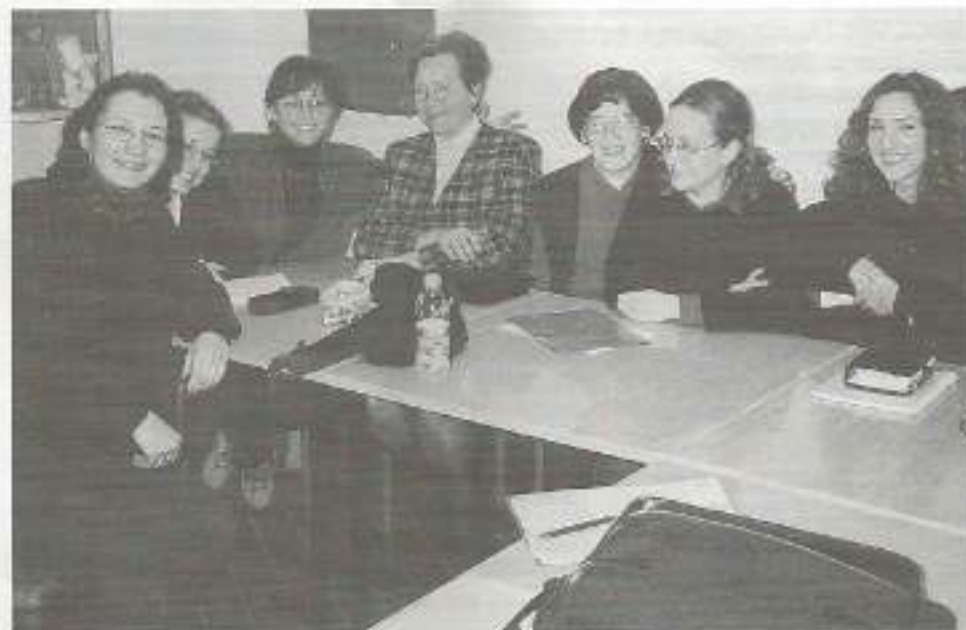
Colleagues at DODIR

According to Croatian laws deafblind people have the same rights as other people with disabilities, but they do not have the services to match. However, DODIR concludes from this survey that there are serious levels of social exclusion in Croatia where 42 percent of the deafblind people who took part said they were virtual prisoners in their own home without any support, even from their families.