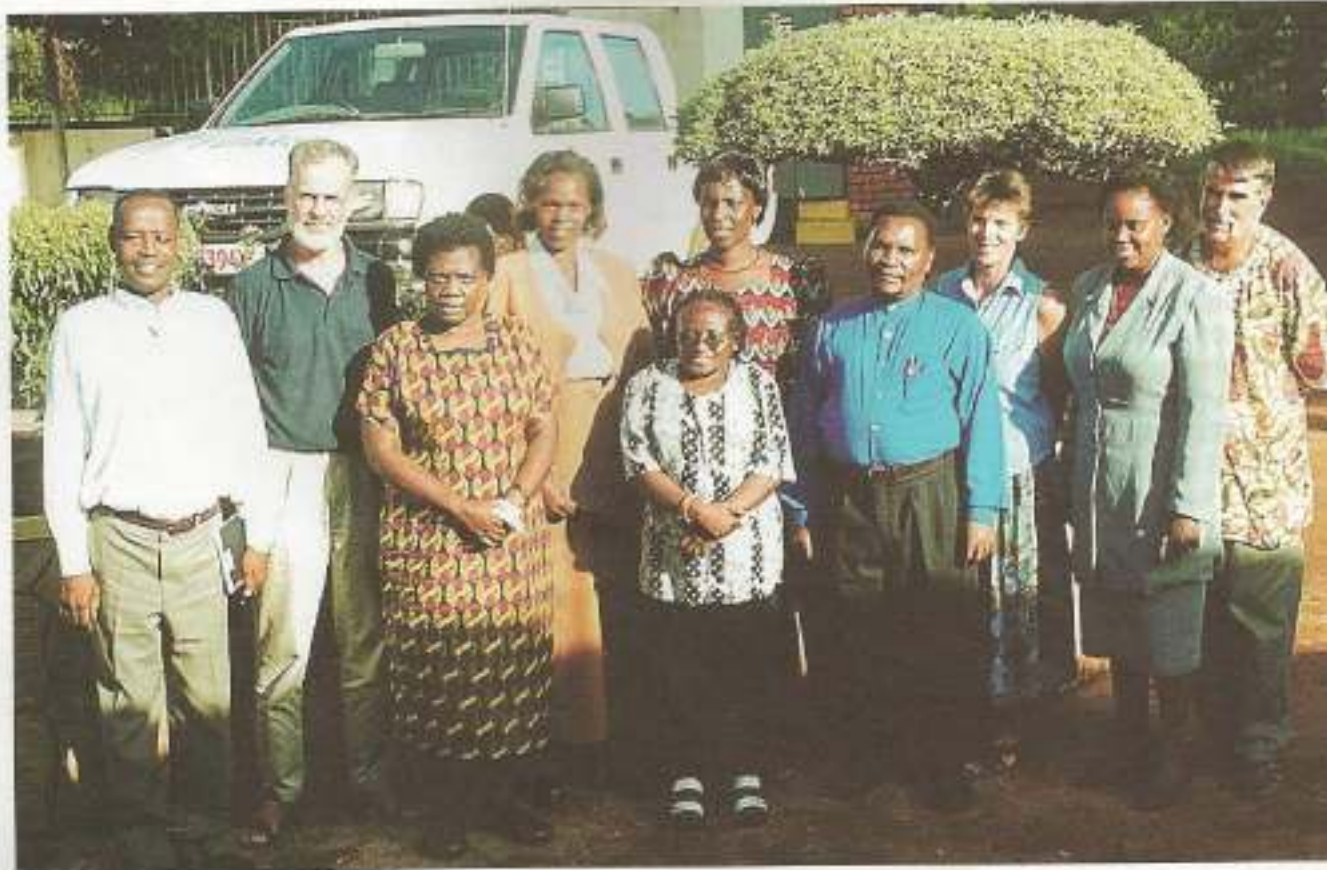
Stakeholders in the newly launched Nairobi Deafblind Unit which will start at Kilimani Primary School.

Four of the students at the unit present a great challenge to the staff at the school as they are unable to cope in a group situation and need training on a one-to-one basis. This way of working was new to most teachers and therefore they have taken courses in how to work with these students, including special communication training, and preparation of individual education programmes.