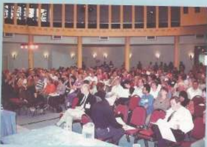
The Conference Hall was full every day for the Plenary sessions.