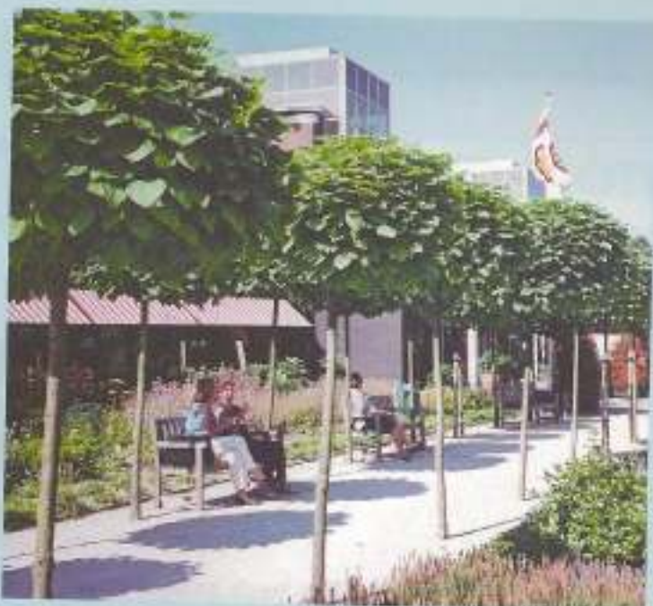
The Golden Tulip Hotel