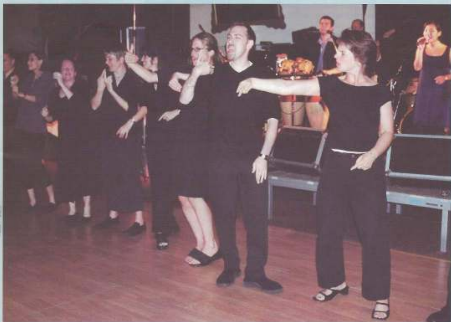
"I Will Survive" ... the anthem of The Interpreters. They did a fantastic job all week.