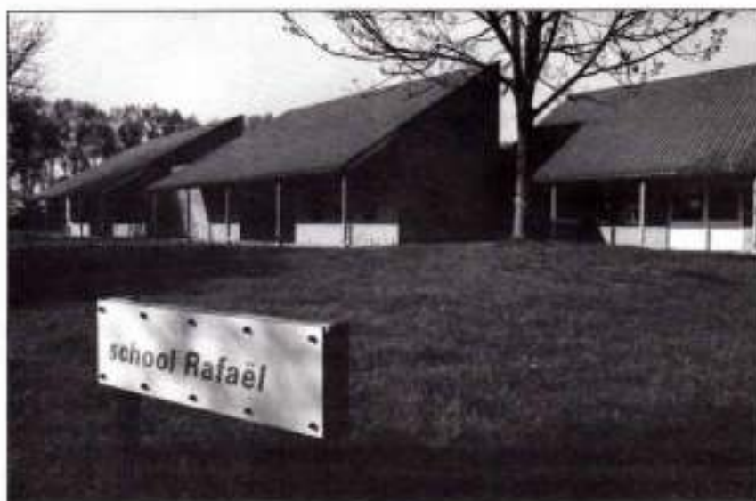
School Rafaël is the deafblind department of the Instituut voor Doven which is based in the town of Sint Michielsgestel

During its first 20 years the department grew slowly, but its development began to accelerate after 1981. In recent years the number of children admitted to the Rafaël department has continued to increase and now numbers 70. One change has been the fall in the proportion of children with Rubella syndrome in recent years, from around 80% of our population ten years ago to some 50% today. Many children admitted in recent years have different syndromes: Zwiellerger syndrome, Goldenhar syndrome, CHARGE association and Usher syndrome. It naturally makes a great difference whether a child is deaf and blind from birth or whether one or both function losses developed at a later stage in the child's development.