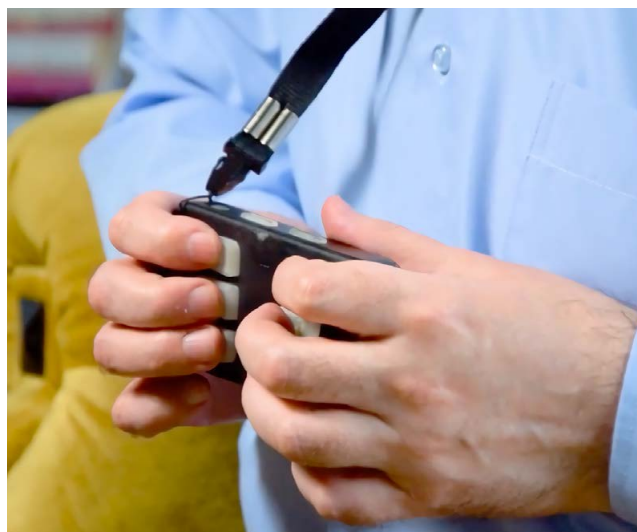
Figure 2. HaptiBraille communicator in use

The principle that underlies the operation of the communicator allows it to be used by various categories of users. Thus, it can be used by people with speech impairment due to stroke or aphasia. In addition, among the users of the device there are people with low sensory level of fingers, since they can