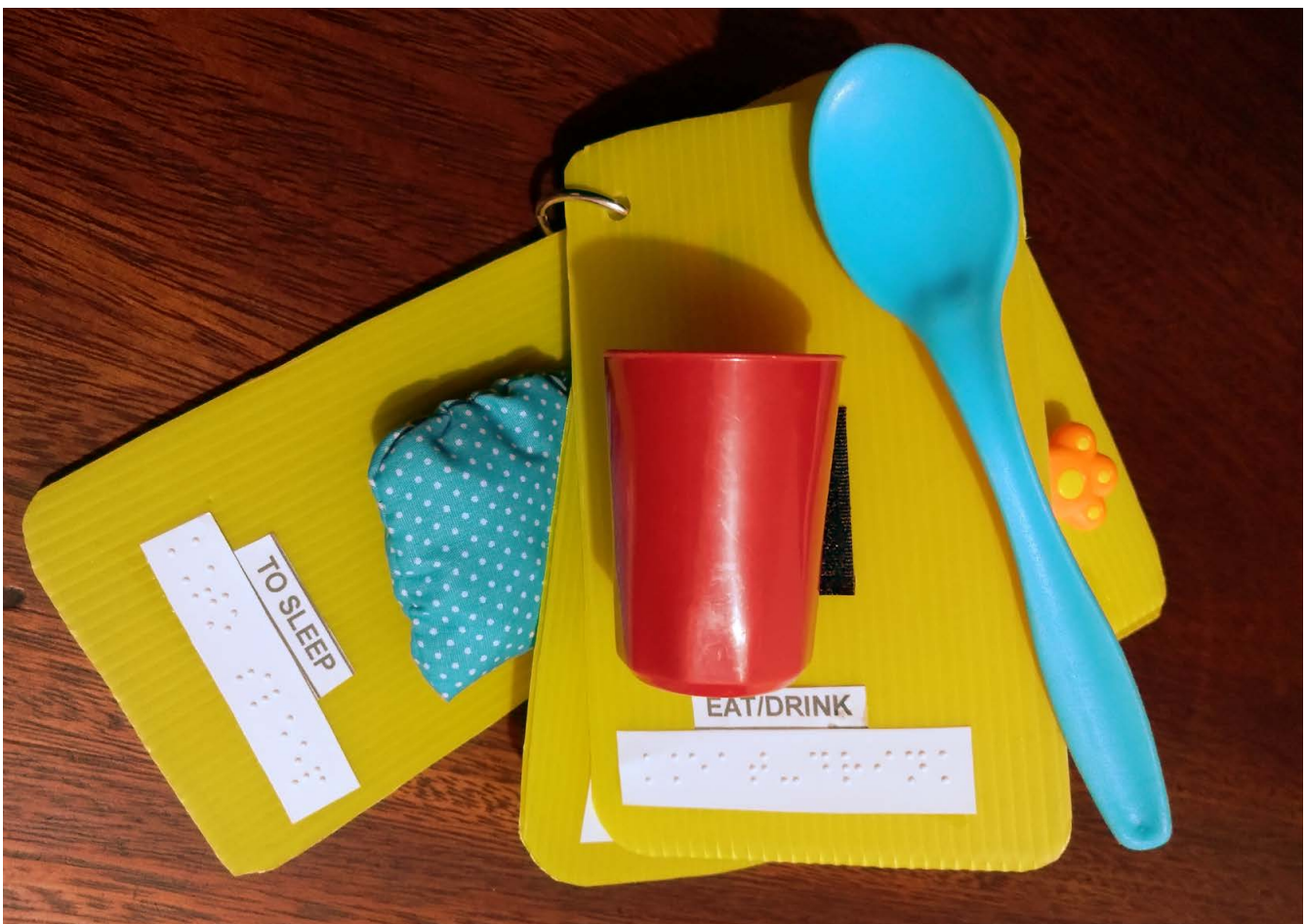
Figure 1. Communication and routine keyring.

The keyring was made with low cost materials. The cards in this reference object key-chain can represent part of a child’s or young person’s routine. The concrete symbols of “Yes” and “No” serve to value the opinion of the young person or child in relation to what they like and don’t like or what they want or don’t want. Images of these materials can be found below.