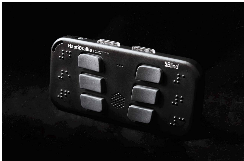
Figure 1. A picture of the device