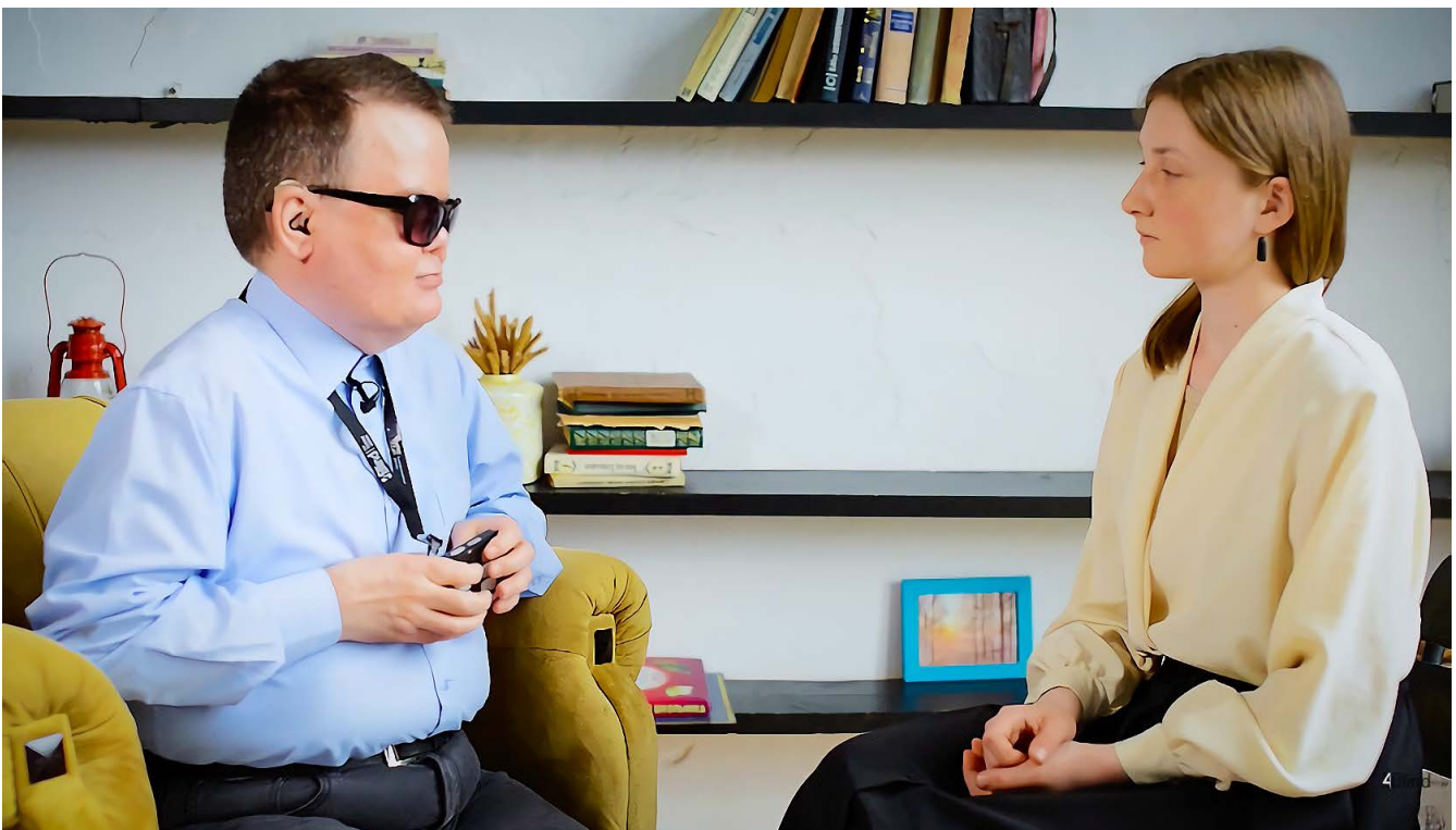
Figure 3. The process of using HaptiBraille communicator