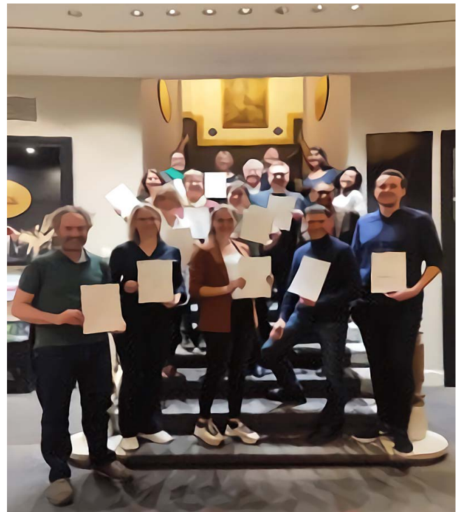
The new TWMS supervisors proudly with their certificates in Copenhagen, Denmark

The participants also expressed that they intend to use the TWMS in the future and they would be involved in staff training. Comments included the following: “We want to share the knowledge and application of the scale through supervision groups in our organization”; “Very excited to cascade this knowledge out across, which may help us to describe deafblindness in our country and promote our cause further”; “The scale has useful applications for other groups also, ASD, PMLD etc.”; “Share outcomes of validity studies on the scale to support uptake with professionals who require hard science evidence base; “We are excited to tell our colleagues about the scale. We are also optimistic and that by using the scale we could make a difference in the lives of people with congenital deafblindness”.